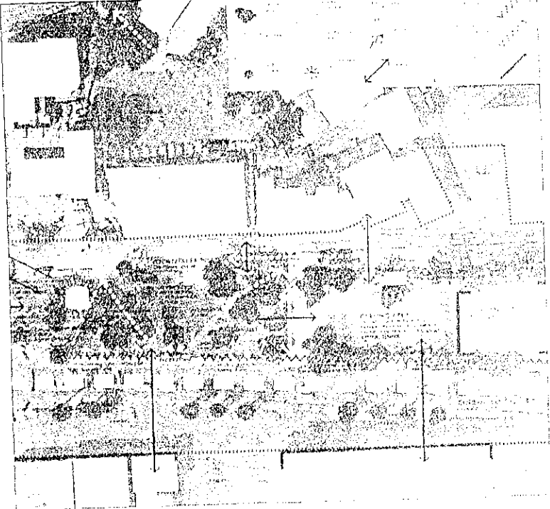
■ An artist's impression of the Pampoenkraal development.