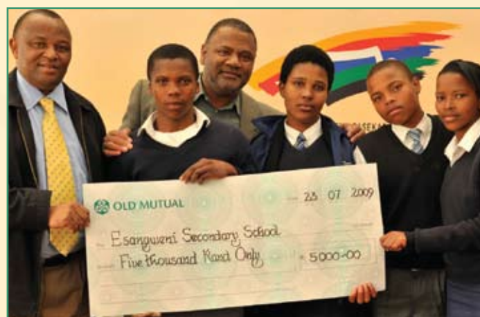
2nd prize – R5 000, 00 for Esangweni High School

The 25 participating learners each received a R100 voucher and a goodie bag.