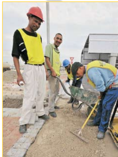
Workers completing the Southern Taxi Terminal in Mitchell's Plain

The Swartklip Sports Complex Project provides a major sports complex in a well-located area that is accessible from both Mitchell's Plain and Khayelitsha and provides opportunities for integration through sport and leisure activities.