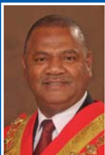
Executive Mayor of Cape Town Dan Plato, is the URP political champion