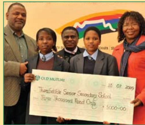
3rd prize – R3 000, 00 for Thembelihle High School

soon be a thing of the past. The road infrastructure makes it easier for the police to patrol and therefore reduce crime. The URP has made things better.