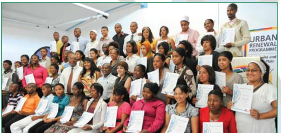
Proud youth with their certificates

Investment in the Watergate Housing Development will amount to R800 000 million over the next 3 years. This public-private partnership project is a pilot. Lessons and best practice models derived from this project will benefit the city, province and municipalities across the country.