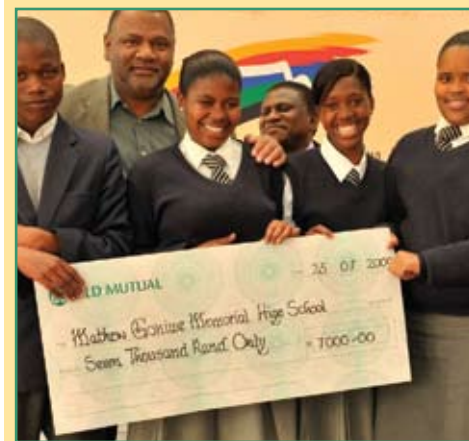
1st prize – R7 000, 00 for Matthew Goniwe High School