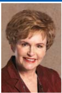
Premier Helen Zille is the URP provincial political champion

For more information on the URP, visit the website at www.capetown.gov.za