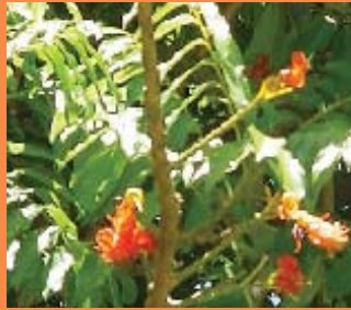
Moreton Bay Chestnut