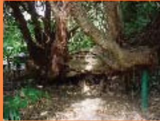
New Zealand Christmas Tree

Teaching the younger generation how to catch tadpoles