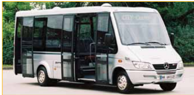
Imizekelo yeenkonzo zeebhasi ezinikezela kwimizila emikhulu

Ixabiso lokukhwela liyakufikeleleka kwaye lithelekiseke nelo lihlawuliswa ziibhasi kwakunye neetaxi, kungokunje