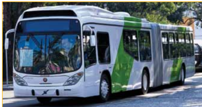
Imizekelo yeenkonzo zeebhasi ezikwimizila emikhulu