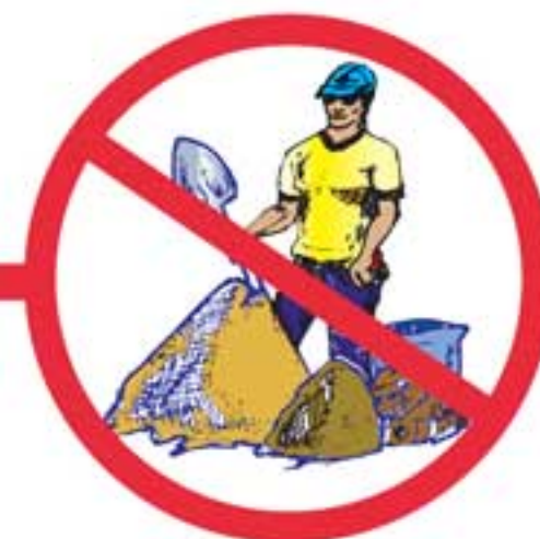
Building Rubble Amaqhekeza amatye olwakiwo Bourommel