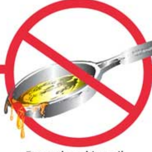
Fat and cooking oil Amafutha ne-oli yokupheka Vet en kookolie