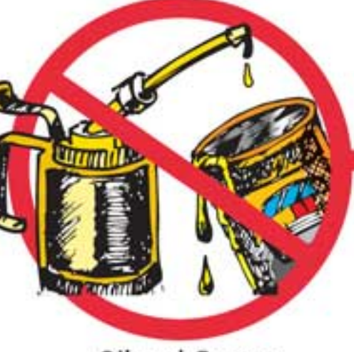
Oil and Grease phathekayo Olie en ghries