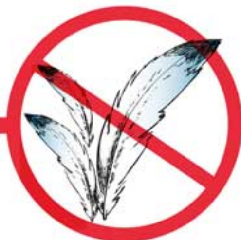
Feathers Iintsiba Vere