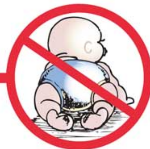
Disposable Nappies Izishuba/amanapkeni alahlwayo Weggooidoeke