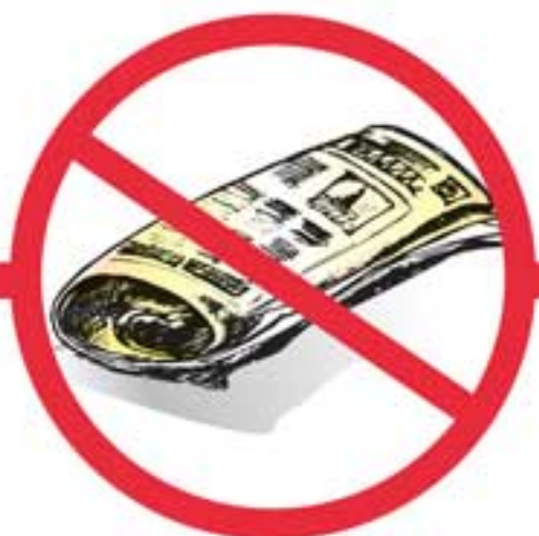
Paper and Newspaper Amaphepha namaphepha-ndaba Papier en koerante