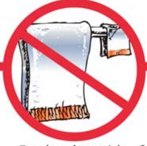
Towels and materials Amalaphu okosula nezinye izinto ezi- Handdoeke en materiaal