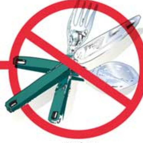
Cutlery I-Oli engamafutha kunye ne-oli yoomatshini izixhobo zasekhitshini Messegood