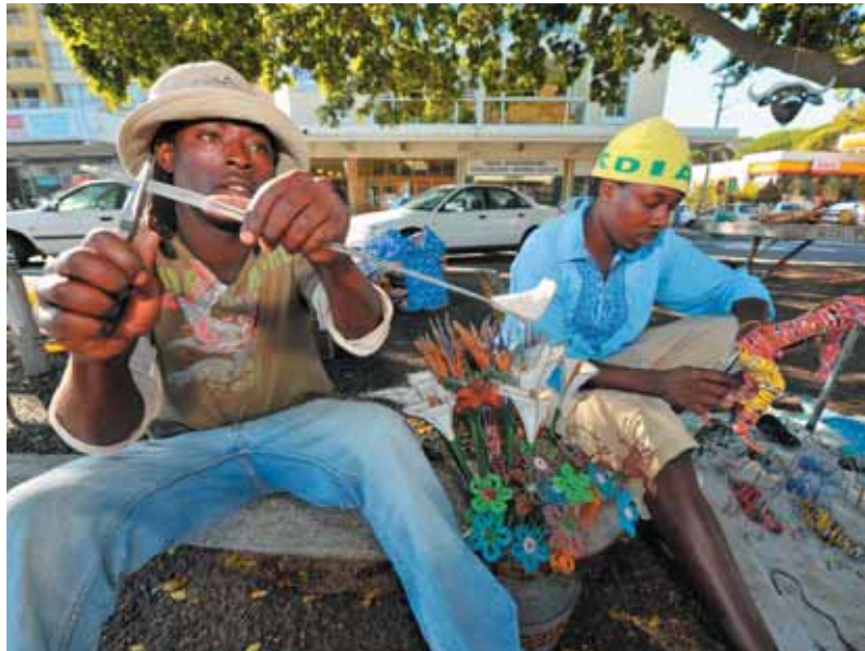
Meeting many needs: The City's budget is spent on a wide range of activities, from providing support to small business to building bridges and cleaning streets.