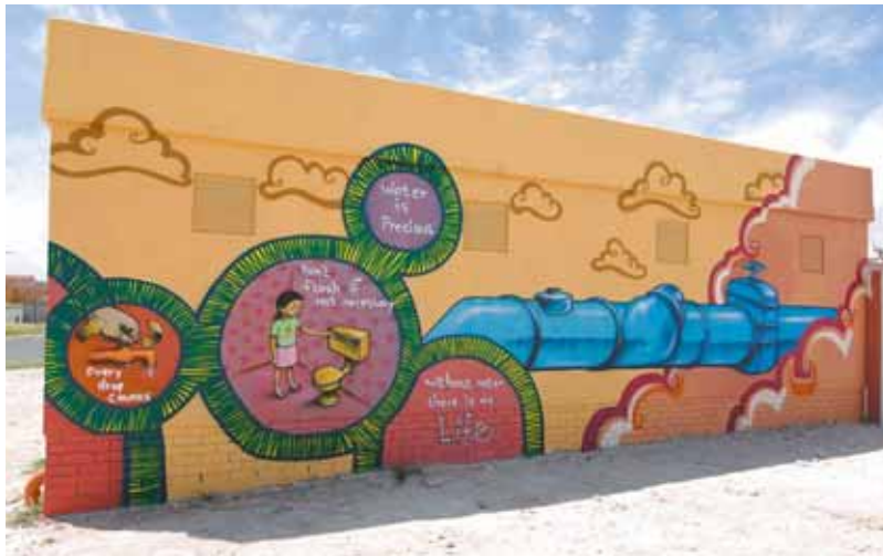
Every drop counts: A mural on the wall of the City's Mandalay pressure management station (above), the sophisticated management equipment in the station (top right) and a domestic water management device (bottom right).

Water that leaks through faulty tap washers and toilet cisterns, or leaks in the water piping on your property, is added to your account, and you will end up paying for water that you did not use.