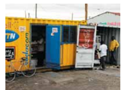
Help for those who need it most: The City's draft budget proposes more money for housing, free basic services and support for economic opportunity.

doubled its number of housing opportunities to 20 000.