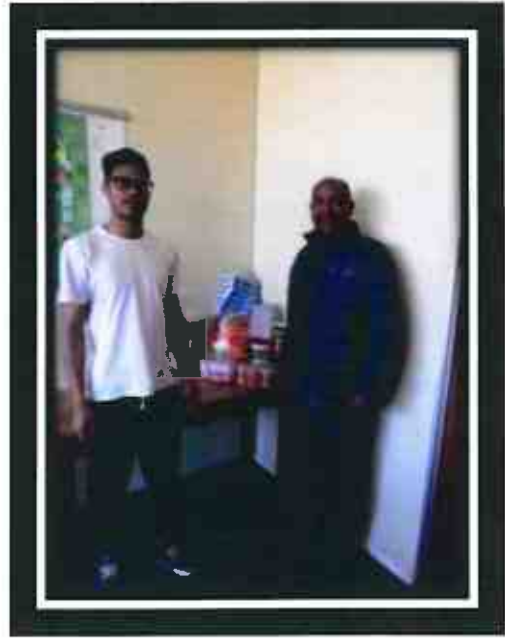
CHURCH OF THE NAZARENE BONTEHEUWEL

The following food items were distributed during the 2019/20 year;