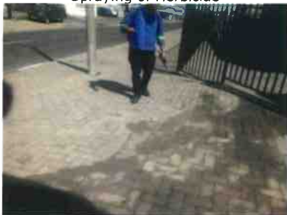
Spraying of Herbicide