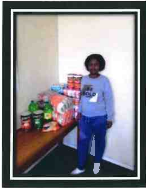
LANGA BAPTIST CHURCH