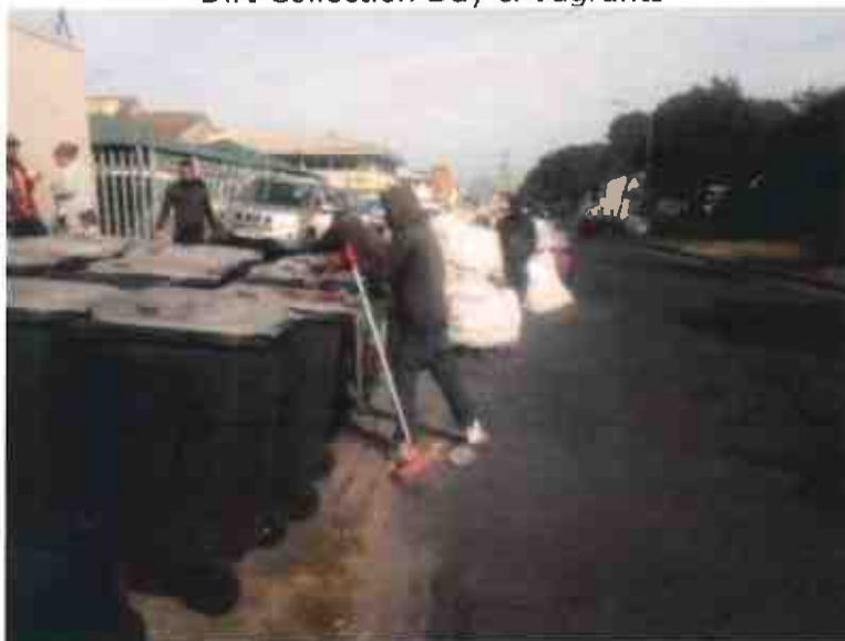
Dirt Collection Day & Vagrants

A monthly report highlighting all cleansing completed, is sent to all owners, tenants and other interested parties.